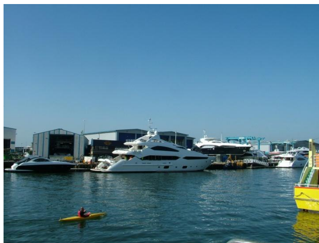
A Sunseeker Luxury boat