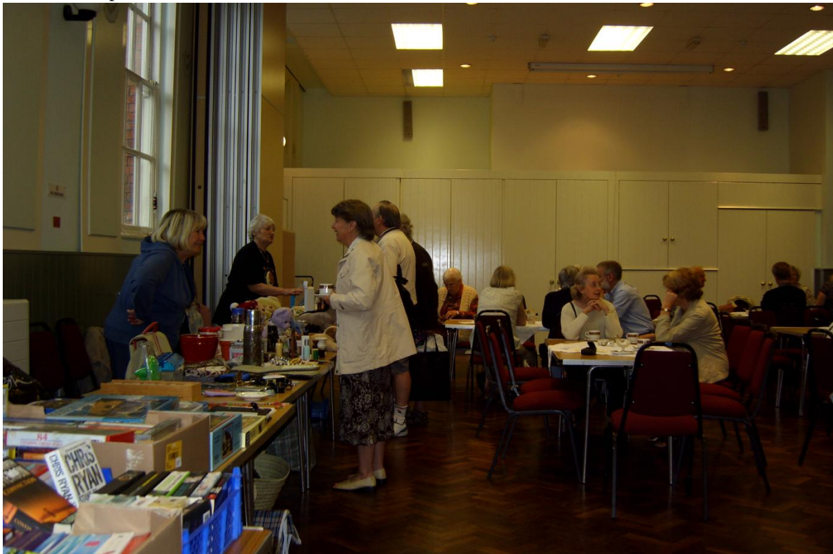
Part of the Church Centre – during a coffee morning

The Church Centre is let out to various groups and can seat 85 for dining, or 120 if seated in lecture room format. Modest fees are charged for outside users and a discount is allowed for Church events which take place in the Centre.