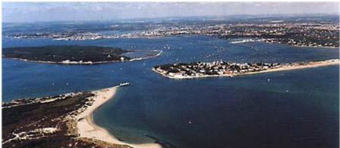
Poole is a beautiful place