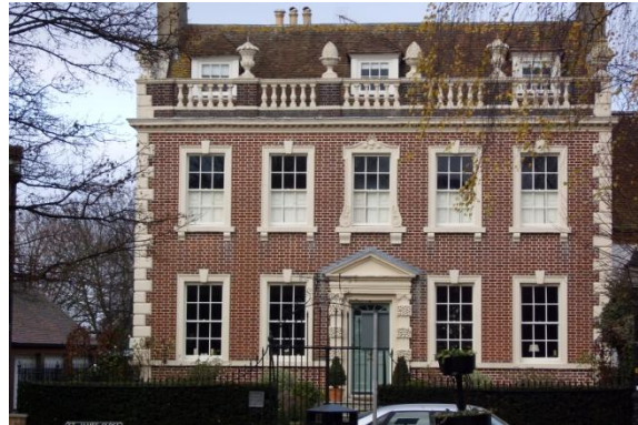
Georgian Mansion near our Church

Our Parish Church is located in the Centre of the Historic Old Town Conservation area, where several Georgian Merchants' Houses are preserved.