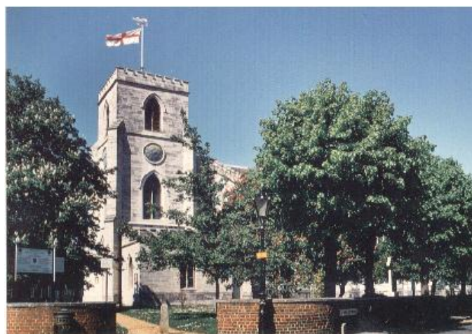
St. James's Church, Poole