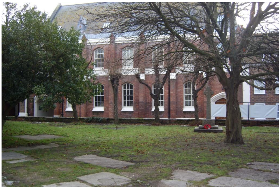
The Church Centre viewed from the Churchyard