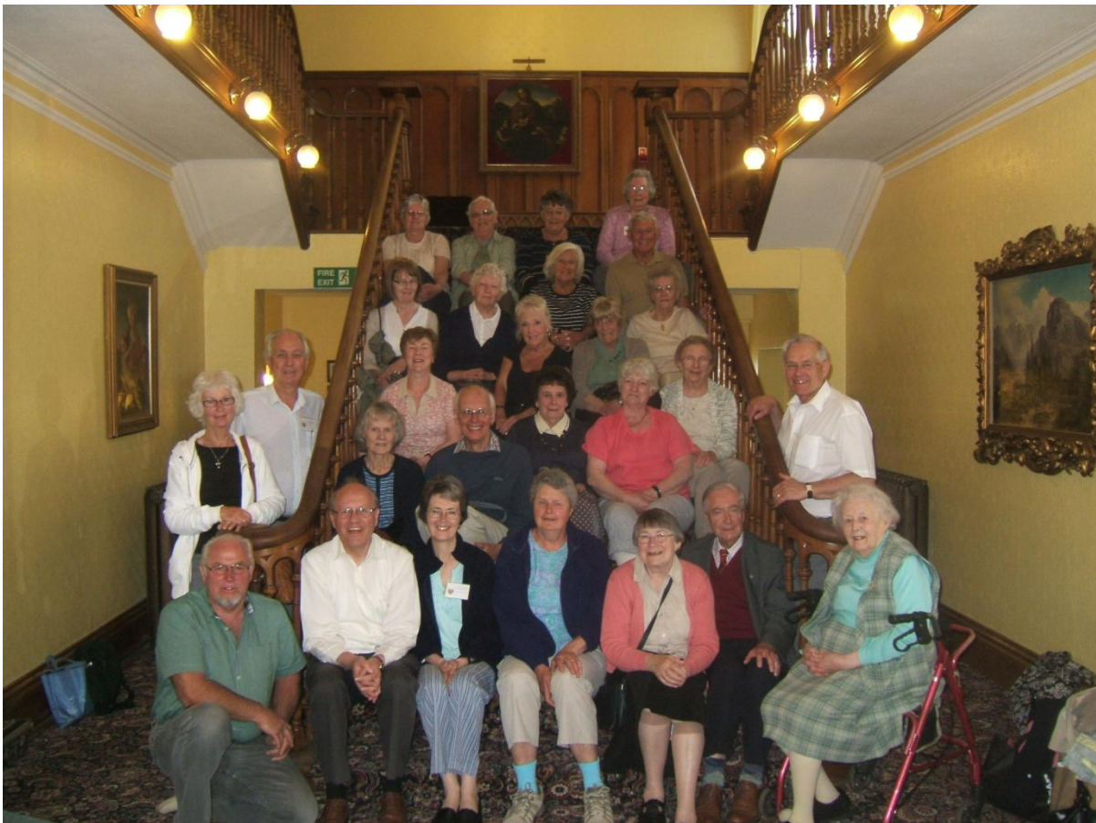
The Sidmouth House Party - 2011

A similar activity has been provisionally arranged for May, 2012.