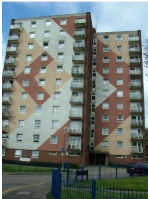
High Rise dwellings

The Parish itself is defined by the coastline on the south side and the London to Weymouth railway line on the north side. On a fast train one can be in London in one hour and forty minutes. Within the Parish there exists a real mixture. There are high rise 1950s style flats, several new housing developments, large and small commercial undertakings, including Sunseeker International – one of the largest leisure boat producers in the world. The Headquarters of the RNLI is also located in our Parish. Not surprisingly, the Parish has its areas of wealth and comfort, but like any other town, there exist the less fortunate people, many of whom are struggling.