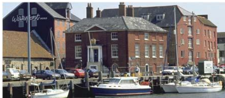
The Quay, Poole

Building on the present St. James's Church began in 1819 on the site of the original Church which had been the centre of Poole's worship since 1142. Much of the stone from the old building was used in the new Church. The present Church was consecrated and opened for Worship in April, 1821. It cost £11,740 to rebuild and today it is insured at a sum in excess of £7 million. It is a Grade 2* Listed Building.