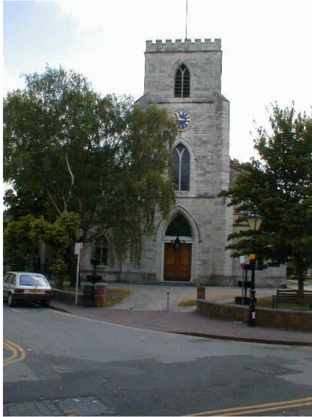
St. James's Church, Thames Street, POOLE