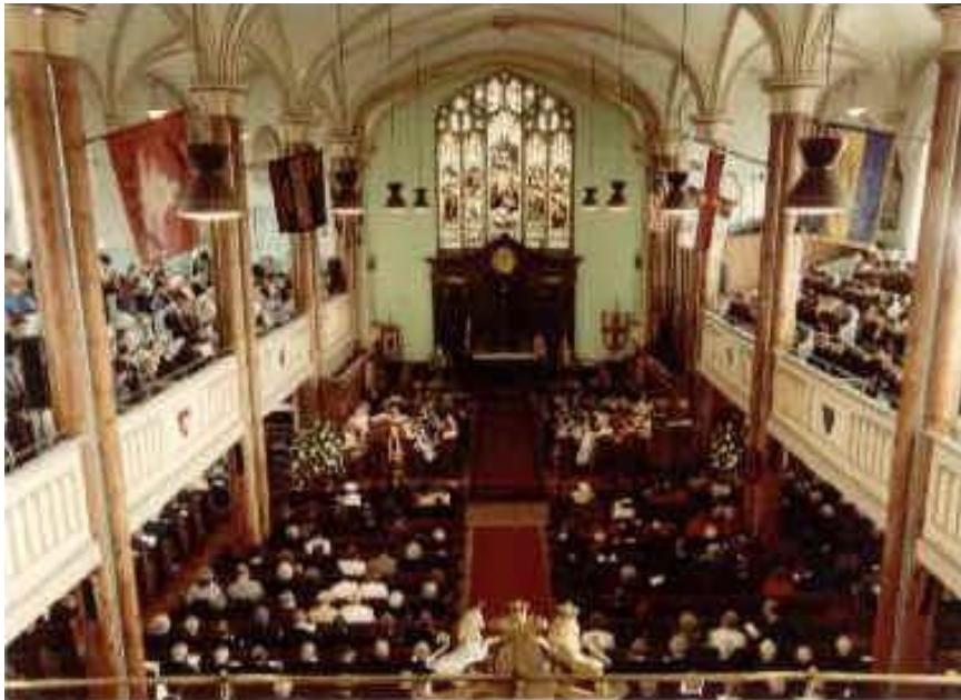
St. James's, facing the East showing the gallery and pillars

The Church roof is supported by pine pillars brought across to Poole in Georgian times from Newfoundland as part of the flourishing Newfoundland trade..