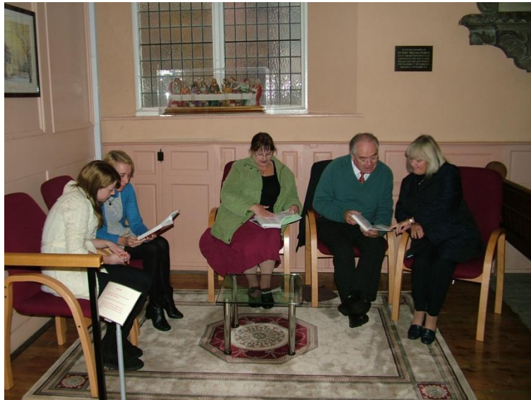
The Quiet Area within the Church

St. James's Church has a gallery which originally housed the organ. The seating in the gallery is stepped, and was built when a very high Pulpit was in place and the Preacher could see everyone and vice versa. Today however, the viewing capacity is limited on the north and south sides in places, and to be realistic, it is suggested that a maximum of 500 seated with a reasonable sightline, is the estimated Church capacity.