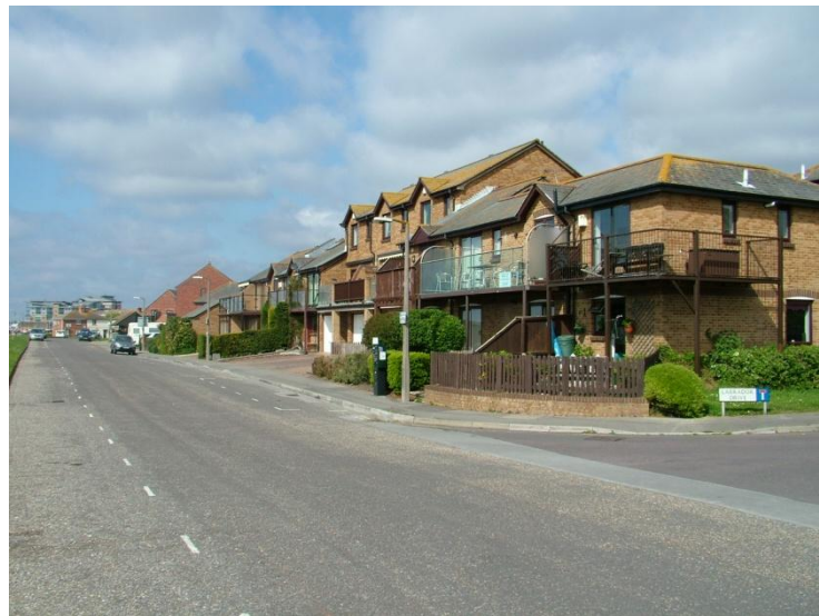
Recent housing development

The Old Town Re-generation Project is under way and will provide a second bridge to give additional motor and pedestrian crossing to Hamworthy. The new Twin Sails Bridge is due for completion in the Spring of 2012 and a major development scheme both sides of the bridge is being planned at this time. This will involve an hotel, restaurants, commercial units and accommodation for 3,000 people. When these developments come to fruition it will substantially increase the population of our Parish.